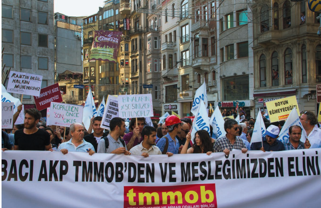
Delivering a message. Turkish engineers and architects assemble on 13 July for march on Taksim Square.